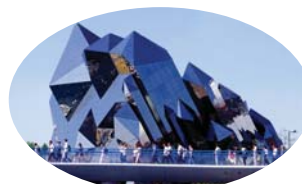
Futuroscope - Poitiers (FR) 2 millions of people / year seat down on RAIGI's seats

It is not the end, contact us for more information