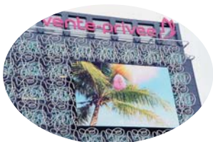
headquarters "Vente-Privée" (Paris 2015) concrete molding, RAIGI formulation