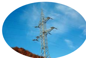
Daily, RAIGI connects you to the electricity network