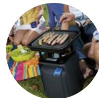
LPG Tank (since 1997) Raigi, exclusive supplier