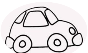
Worldwide, 1 car out of 2 gets some RAIGI's products